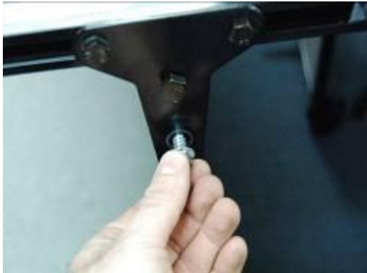
Step #6: Insert 7/16" bolt as shown, top and bottom.