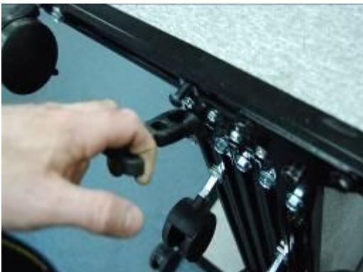
Step #16: Clasp transport lock as shown.