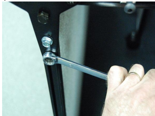
Step #9: Tighten all bolts.