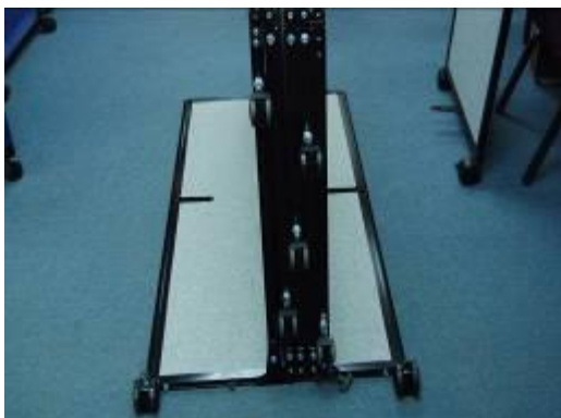
Step #10: Rotate partition assembly so it rests on the back of the end panel.