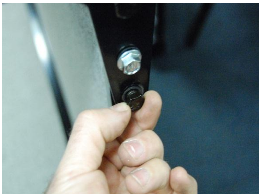
Step #8: Insert 1/2" bolt into rectangular nut, top and bottom of partition.