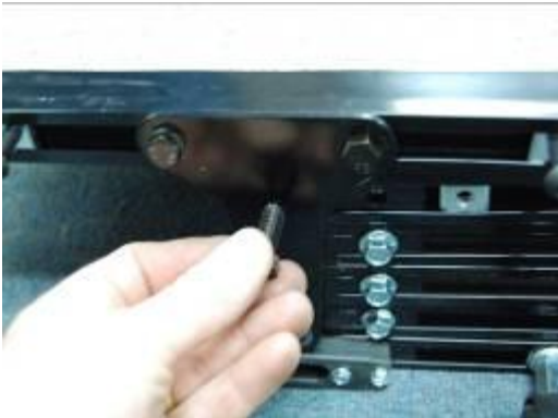
Step #4 Insert 9/16" bolt on top hole on both ends, finger tight.