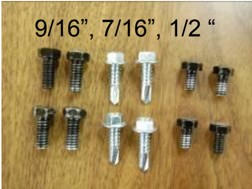
Recommended Tools 7/16", 1/2", and 9/16" wrench