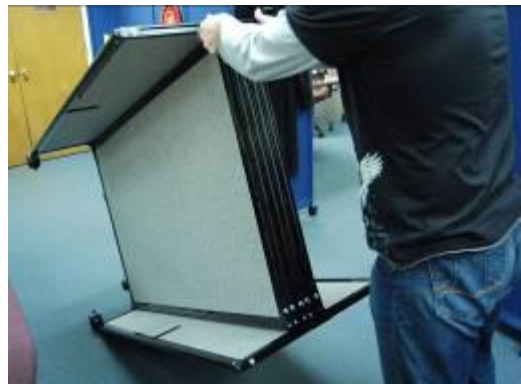
Step #17: Carefully lift partition in the upright position.