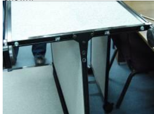
Step #5 Rotate the first panel 90 degrees as shown.