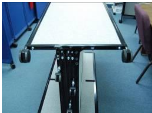
Step #11: Place second end panel on partition assembly as shown.