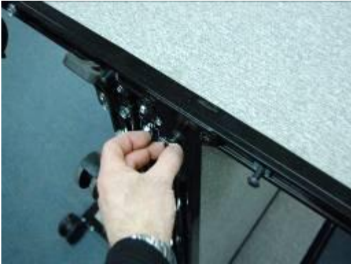
Step #12: Insert 9/16" bolt in top hole as shown, top and bottom.