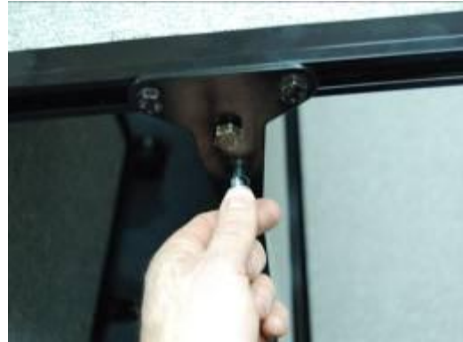
Step #13: Insert 7/16" bolt as shown, top and bottom.