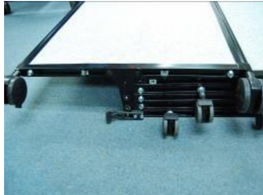
Step #3: Place one of the end panels on top of the assembly as shown.