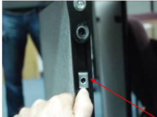
Step #7: Locate rectangular nut and slide up channel and align with last open hole.