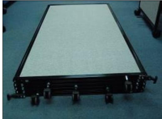
Step #1 Place Partition Assembly on the floor as shown.