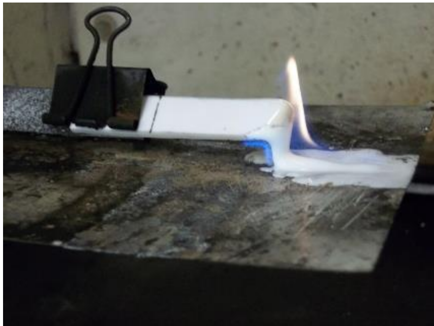
Photo No. 4 Testing in Progress