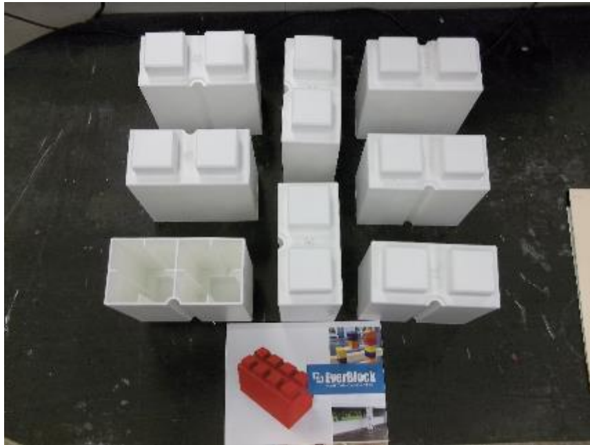
Photo No. 1 Test Specimens As-Received