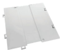
Expansion Joint Contracts up to 3.25"