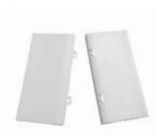
Ramps 6" x 12"

Male and female edge connector ramps make the EverBase® 3 system ADA compliant for pedestrian access points and assist in areas where wheeled equipment is expected to come onto the floor. Expansion joints allow for thermal expansion and contraction between sections.