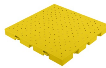
Drainage Top Use alone or with EverBlock Connector Lug