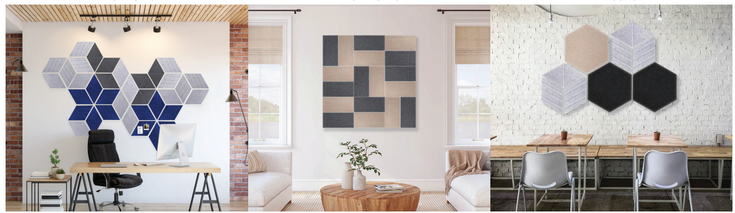
TRIANGLES STANDOFF-MOUNT PANELS SQUARES