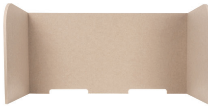
SOUNDSORB TRI-FOLD DESKTOP PRIVACY PANEL