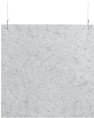
HANGING SOUNDSORB ACOUSTIC PANELS