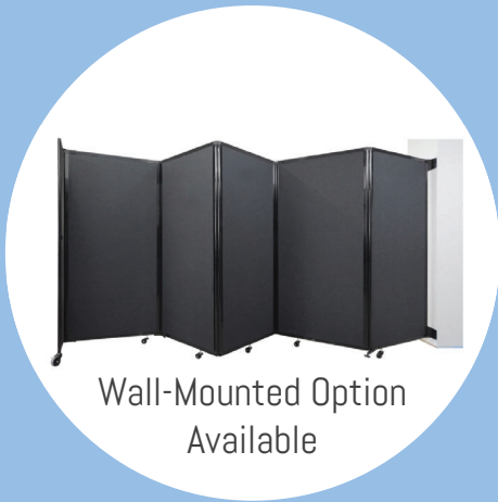
Wall-Mounted Option Available

Available in Fabric, Polycarbonate, SoundSorb & Laminate