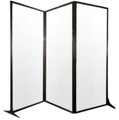
MEDIWALL FOLDING PARTITION