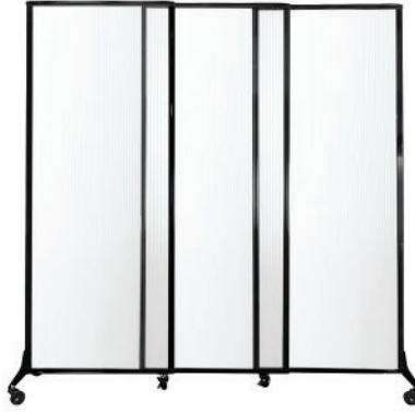
MEDIWALL SLIDING PARTITION